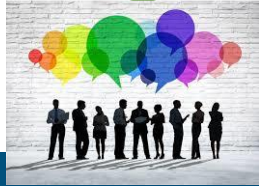
Communicating with Staff